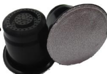
Capsul'in Version 3 Capsule Photo showing complete capsule with seal attached