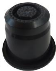
Capsul'in Version 3 Capsule Photo showing top of capsule with the holes for water injection.