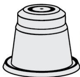
Capsul'in Barrier Capsule Line rendering.

Since the capsule does not require a sachet, or other external packaging to maintain freshness, a smaller retail box can be used allowing you to have more of your product on the shelf.