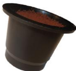
Capsul'in Version 3 Capsule Photo showing coffee in capsule before the seal has been applied.