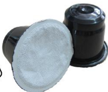
Capsul'in Barrier Capsule Photo of hermetically sealed capsule