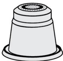
Capsul'in Version 3 Capsule Line rendering.

This capsule is available in retail boxes of 100 capsules or loose quantities for self filling. These capsules can be professionally filled and sealed in sachets for freshness.