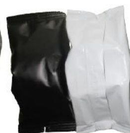
Sachet sealing to preserve freshness.